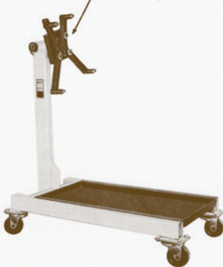
Shown with MS2-SP (Splash Pan Attachment)